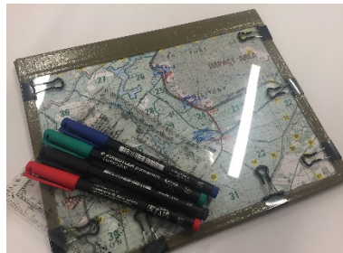
Example Plexiglass Map Board